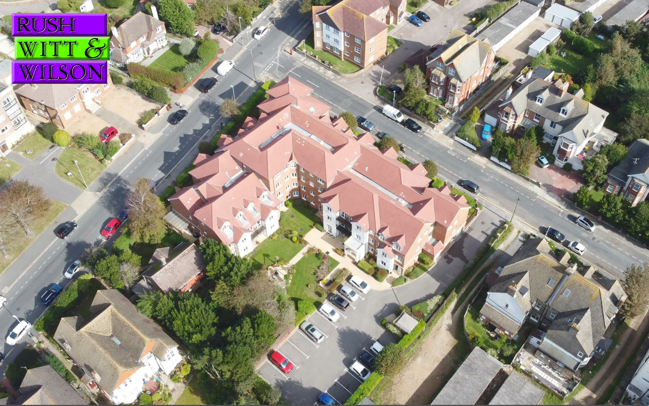
24, Bellview Court Cranfield Road, Bexhill-On-Sea, East Sussex TN40 1QG £155,000